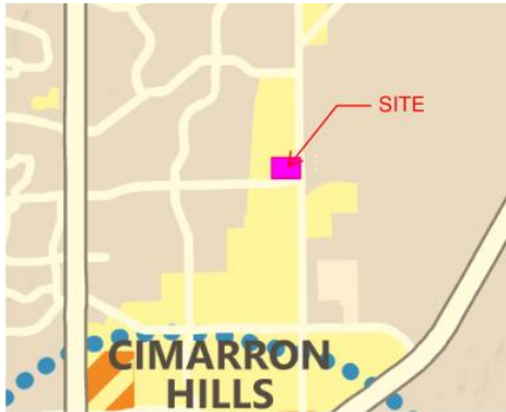
Key Areas (The Enclaves)

The site is captured in the Key Areas and Areas of Change within the “Your El Paso County” Master Plan: