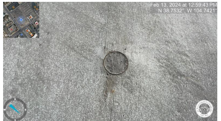
Photo 4: Confirm that Inspection Port covers are removable for future use.