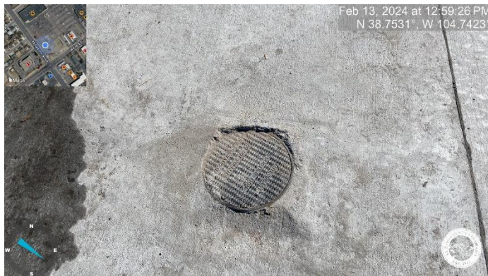
Photo 3: Confirm that Inspection Port covers are removable for future use.