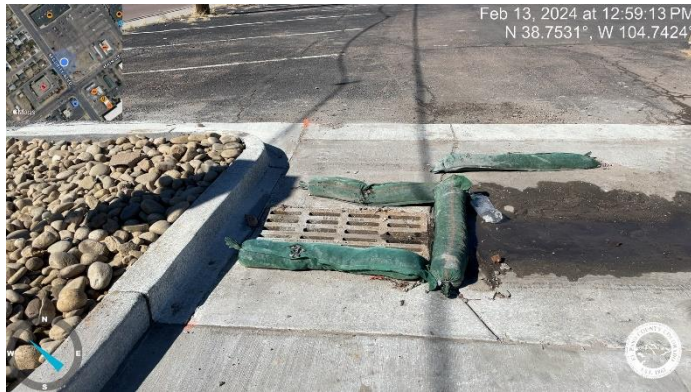
Photo 1: Remove temporary control measures from all inlets (e.g., rock socks and geotextile fabric).