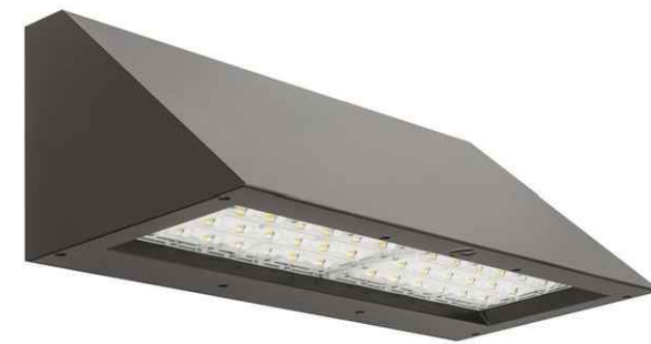
3 WDGE4 WALLPACK LUMINAIRE SCALE: NONE