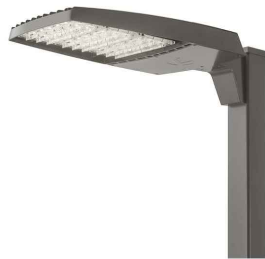
2 RSX3 AREA LUMINAIRE SCALE: NONE