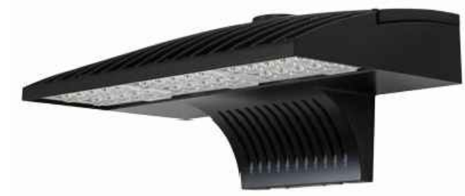
2 DSXW2 LED WALLPACK LUMINAIRE (WP1) ES1.1 SCALE: NONE