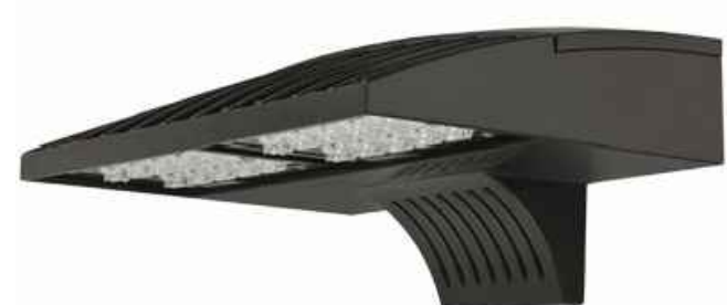
3 DSXW1 LED WALLPACK LUMINAIRE (WP2) ES1.1 SCALE: NONE