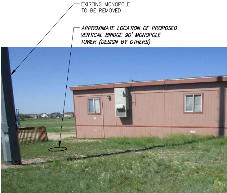
PROPOSED TOWER PHOTO