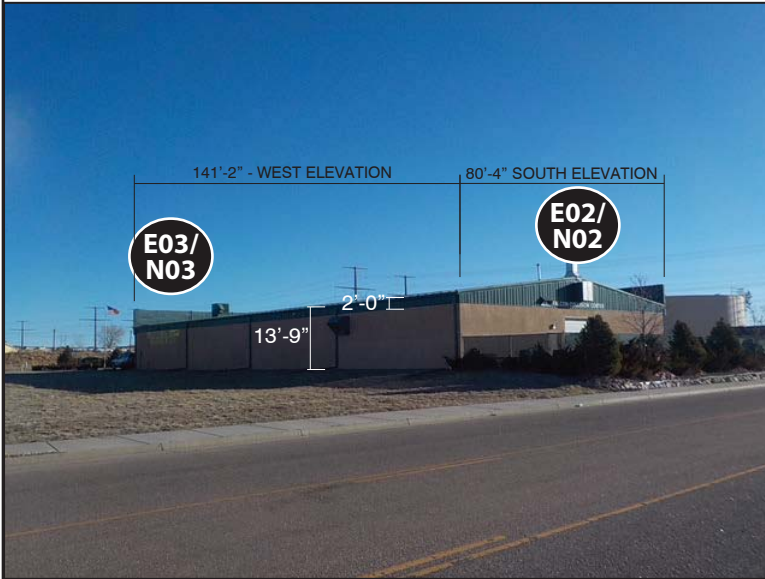
South & West Elevation Existing

Remove existing signage. Patch and paint by others.