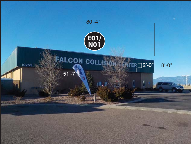
North Elevation Existing

Remove existing signage. Patch and paint by others.