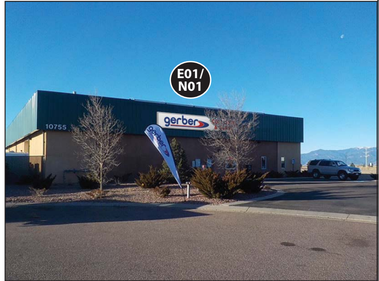
North Elevation Proposed

Remove existing signage. Patch and paint by others.