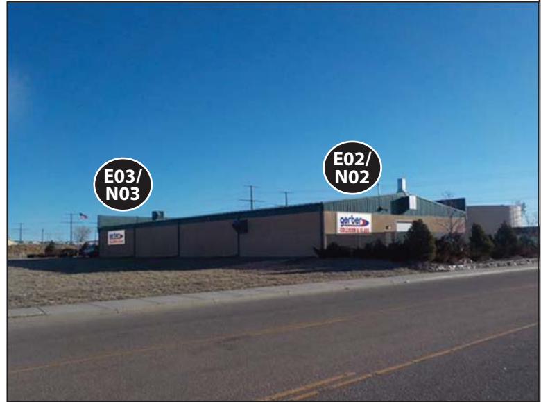
South & West Elevation Proposed

Remove existing signage. Patch and paint by others.