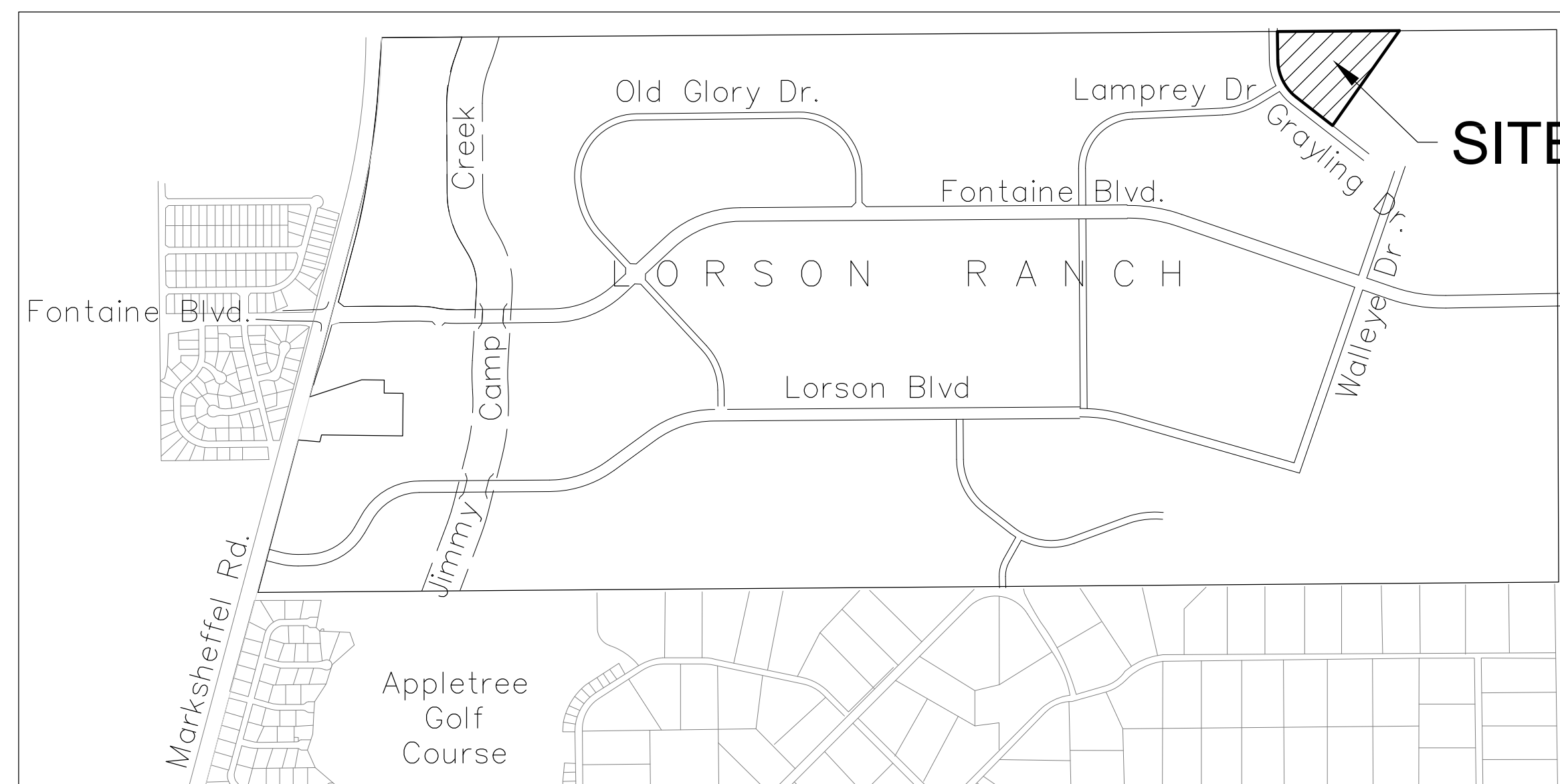
VICINITY MAP NO SCALE