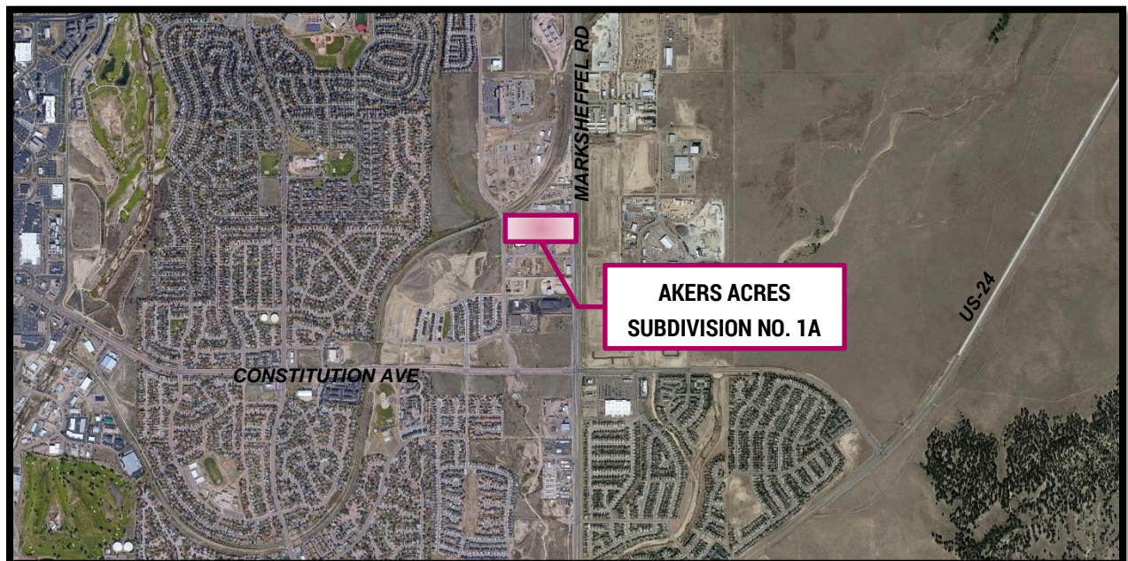
Figure 1. Vicinity Map