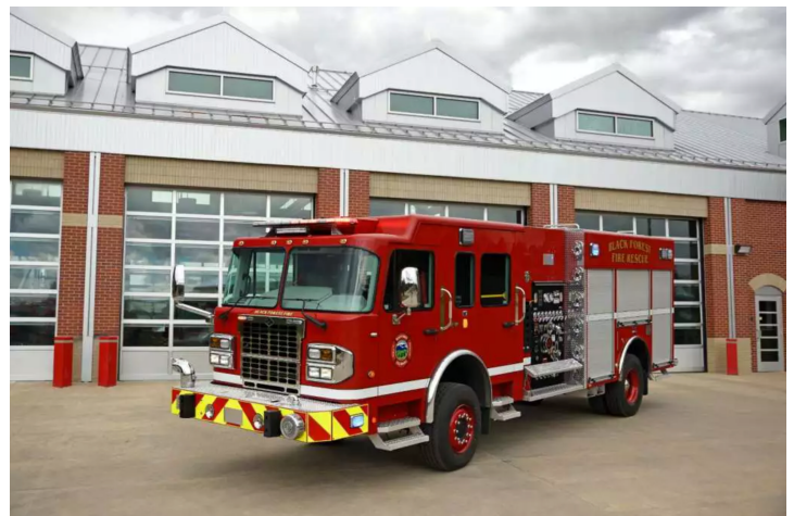
BFFR Fire Engine