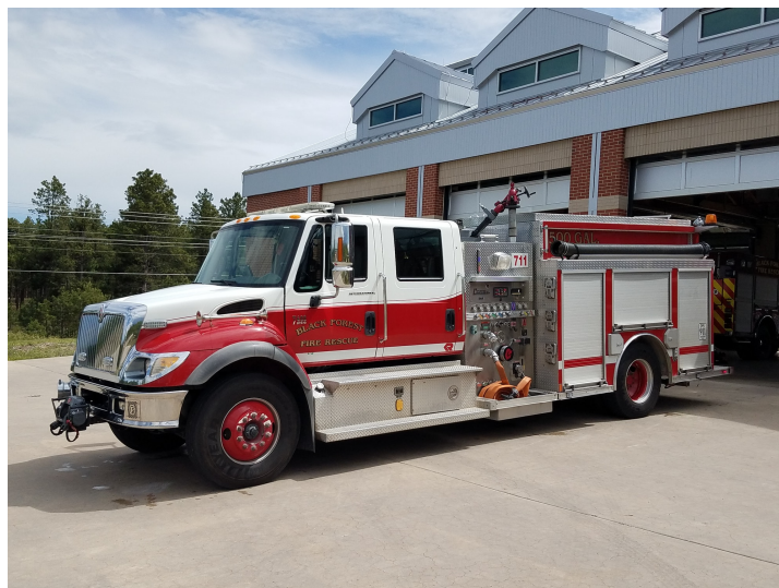
BFFR Fire Engine

The District also has a small reserve fleet consisting of an engine, a tender, and an ambulance.