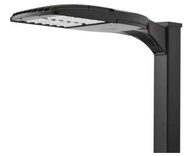
2 DSX1 AREA LUMINAIRE (P1 - P3) ES0.1 SCALE: NONE