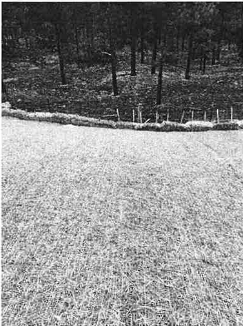
South slope near Wescott Fire Station