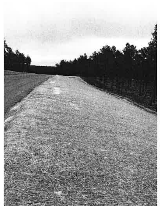
South slope near Wescott Fire Station