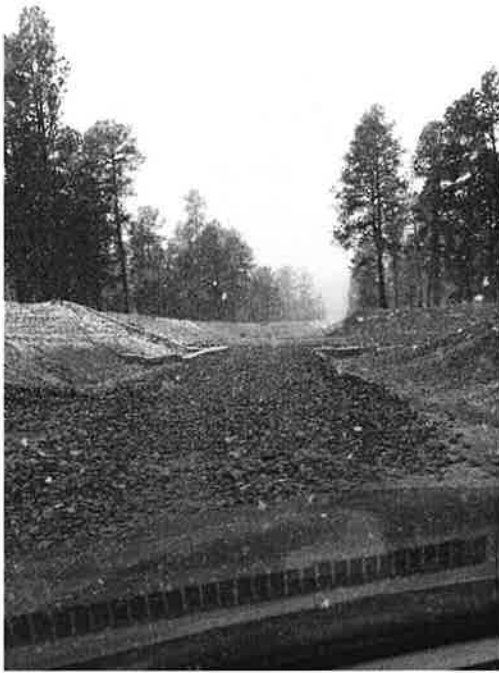
4/24/18 Track Pad at Wescott Fire Station