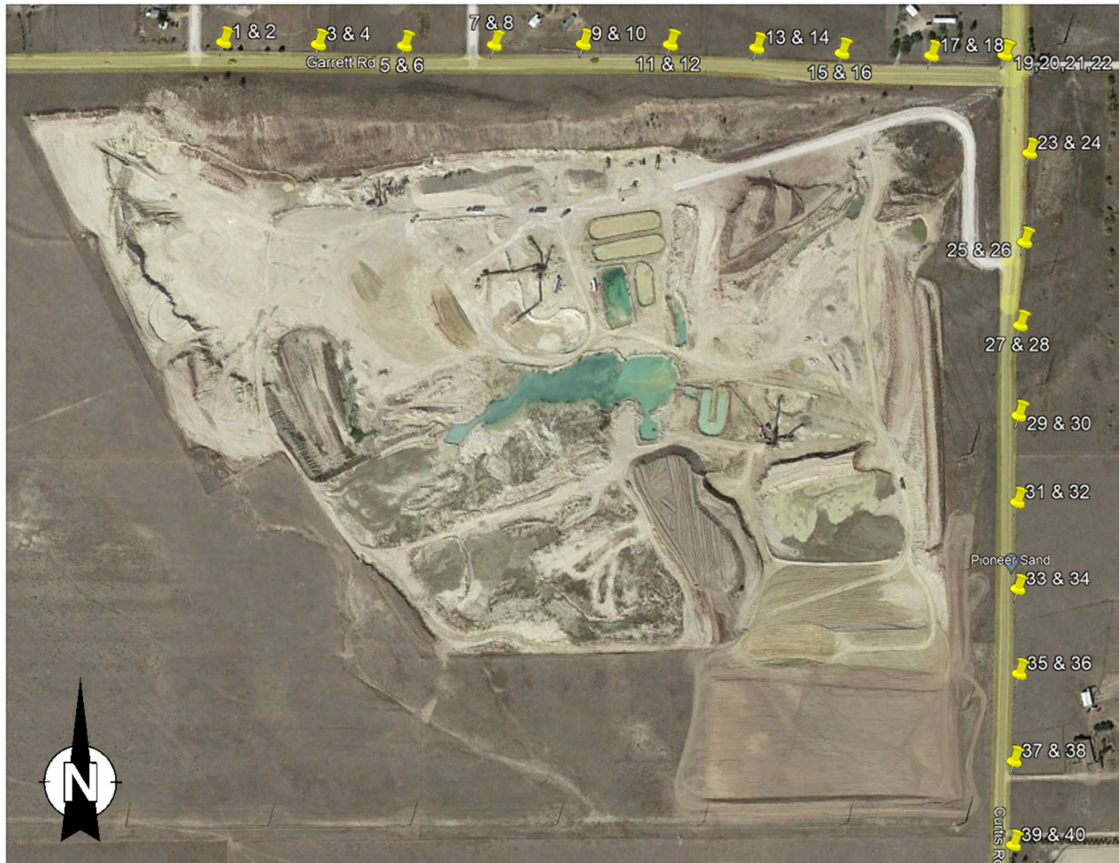
Figure 2: Road Condition Locations

A field review was conducted at the site on Wednesday, June 22 nd to observe roadway conditions. During this review, photos of the roadway were taken at approximate 300-foot intervals. At each interval, a photo of the roadway was taken facing each direction (west and east on Garrett Road, north and south on Curtis Road). Photos are provided in Attachment A. Figure 2 shows the location of photos. Odd number photos are oriented west and north, while even number photos are oriented east and south.