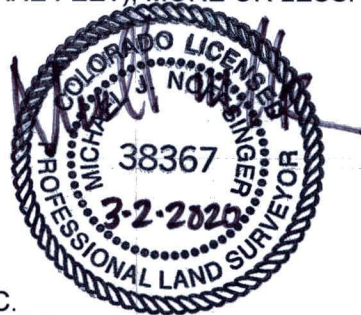
EXHIBIT ATTACHED AND MADE A PART HEREOF.