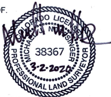
EXHIBIT ATTACHED AND MADE A PART HEREOF.