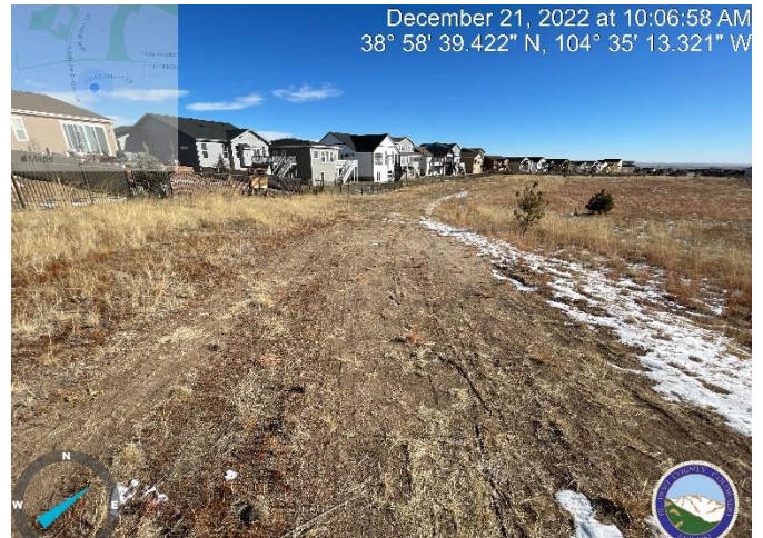
Photo 2: Behind lot 151 of Hidden Ranch Ct. Open area was or is being used as an access road between Stone Valley Dr and Hidden Ranch Ct.