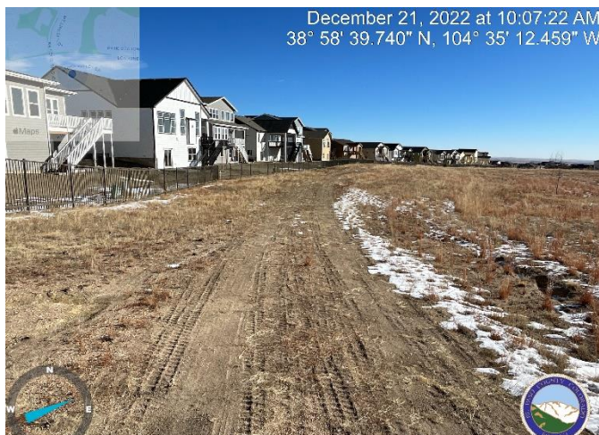
Photo 3: Behind lot 151 of Hidden Ranch Ct. Open area was or is being used as an access road between Stone Valley Dr and Hidden Ranch Ct.