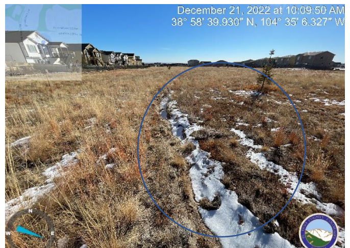
Photo 4: Tract B open area. Rear of lot 151 of Hidden Ranch Ct. Minor erosion rill.