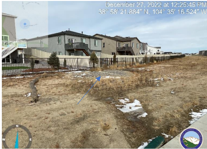
Photo 5: Tract A. Rear of lot 29. Sediment transfer from homeowner looks to have migrated into open area.