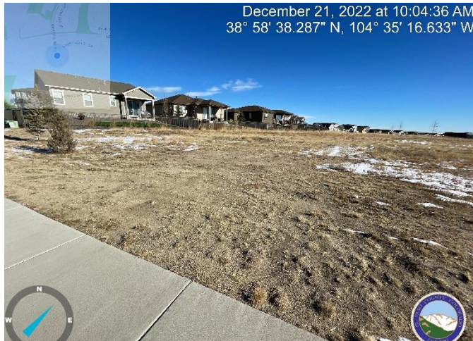
Photo 1: Entrance to Tract B where accessing was or is taking place.