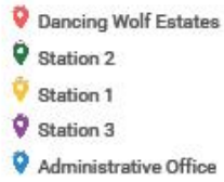
TLMFPD Station and Administrative Office Locations