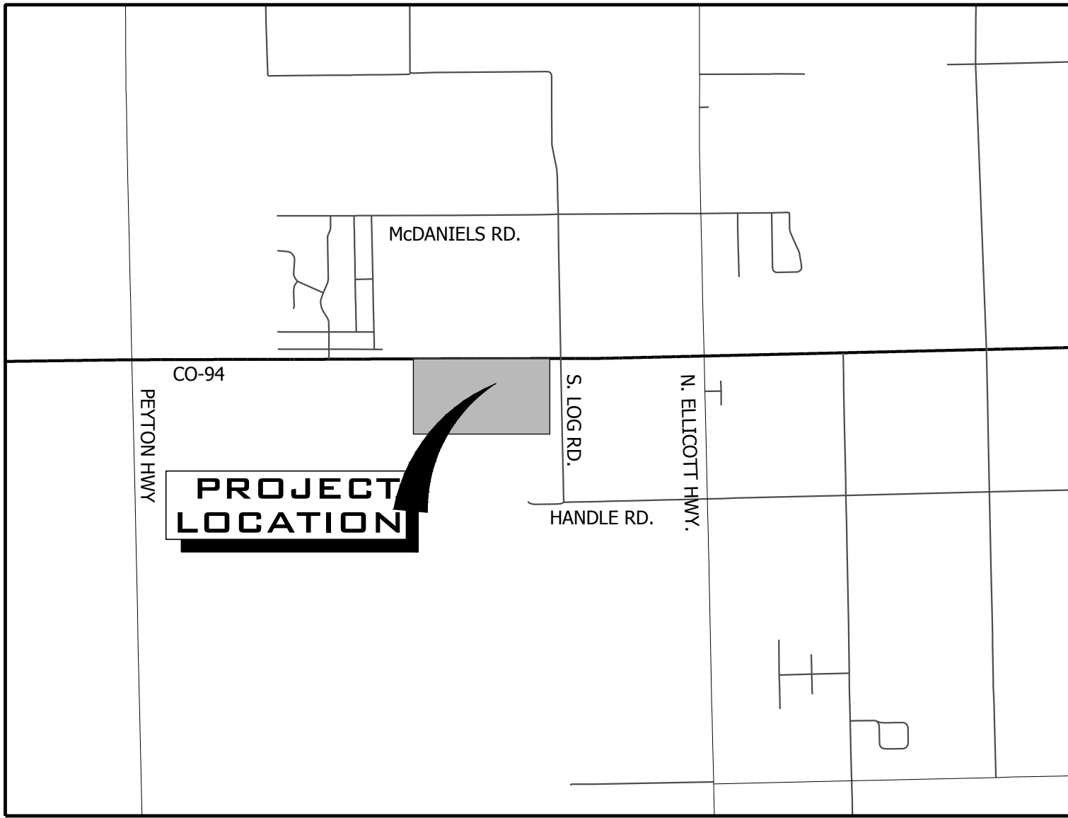
VICINITY MAP SCALE 1" = 5,000'