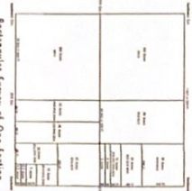
Rectangular Survey of One Section