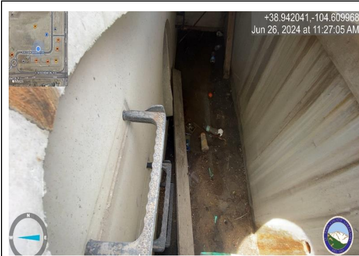
Photo 1: Remove forms and debris from inlets marked with green paint.