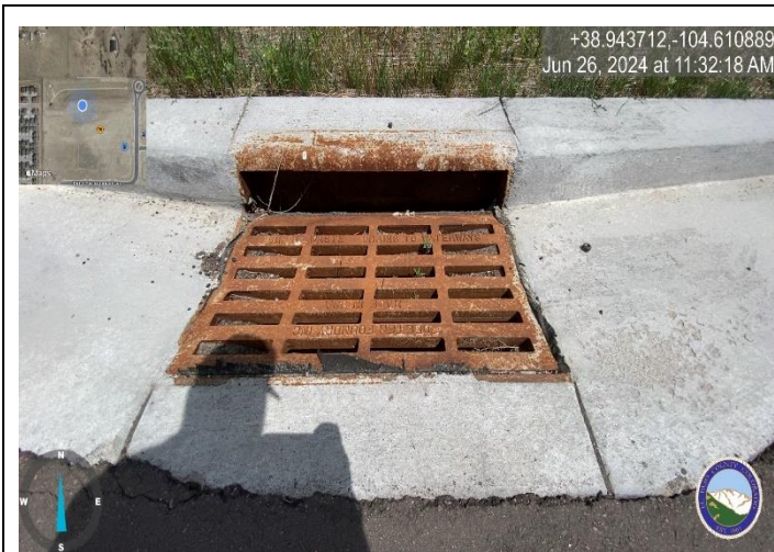
Photo 3: Northern inlets near pond embankment have drop bags installed. Remove and clear debris from inlets.