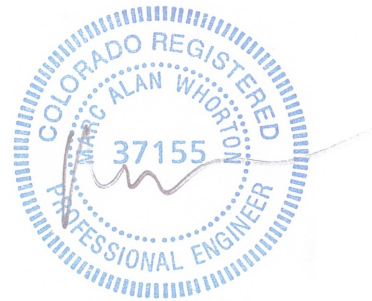
Seal & Signature of P.E.