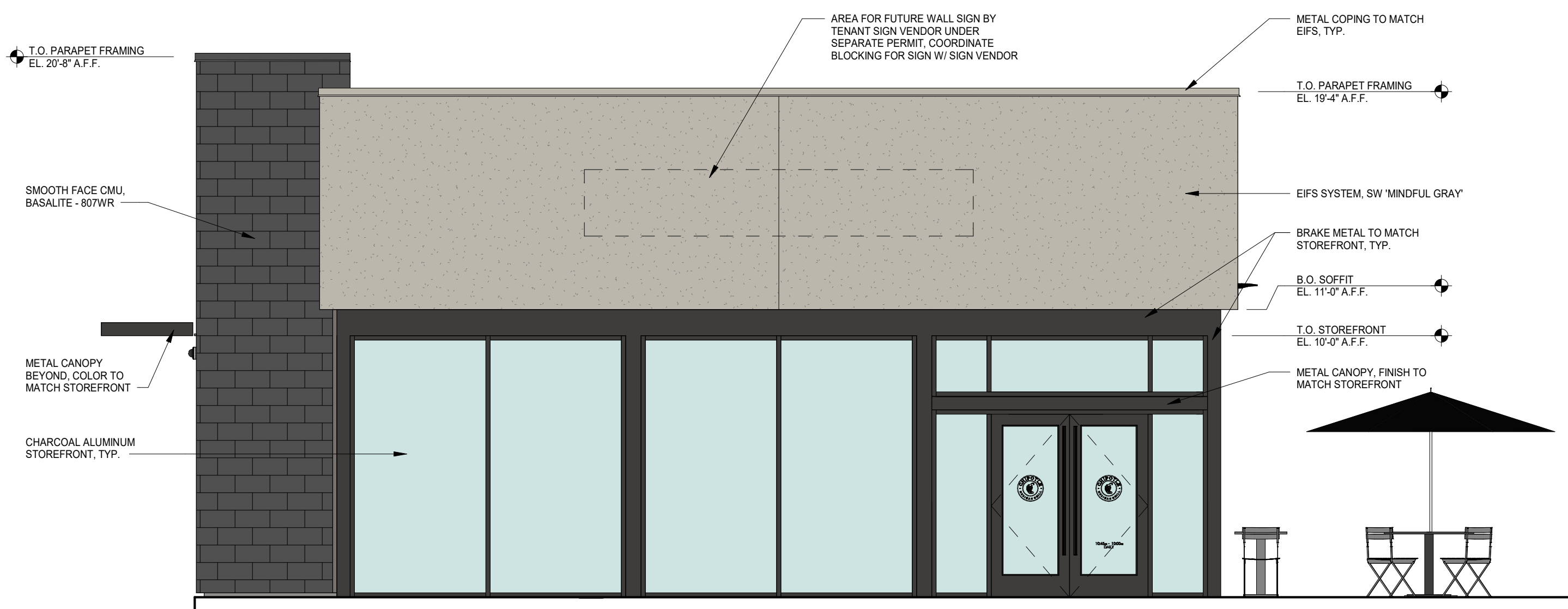
4 BUILDING ELEVATION - EAST 1/4" = 1'-0"