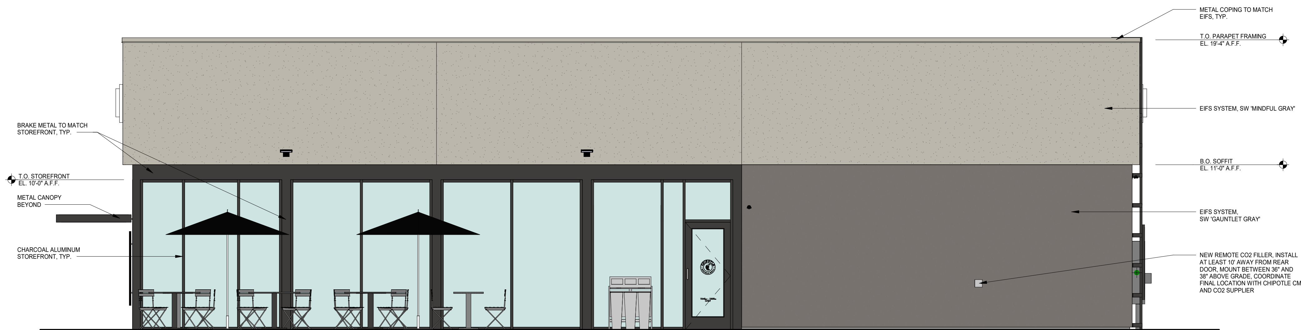
1 BUILDING ELEVATION - NORTH 1/4" = 1'-0"