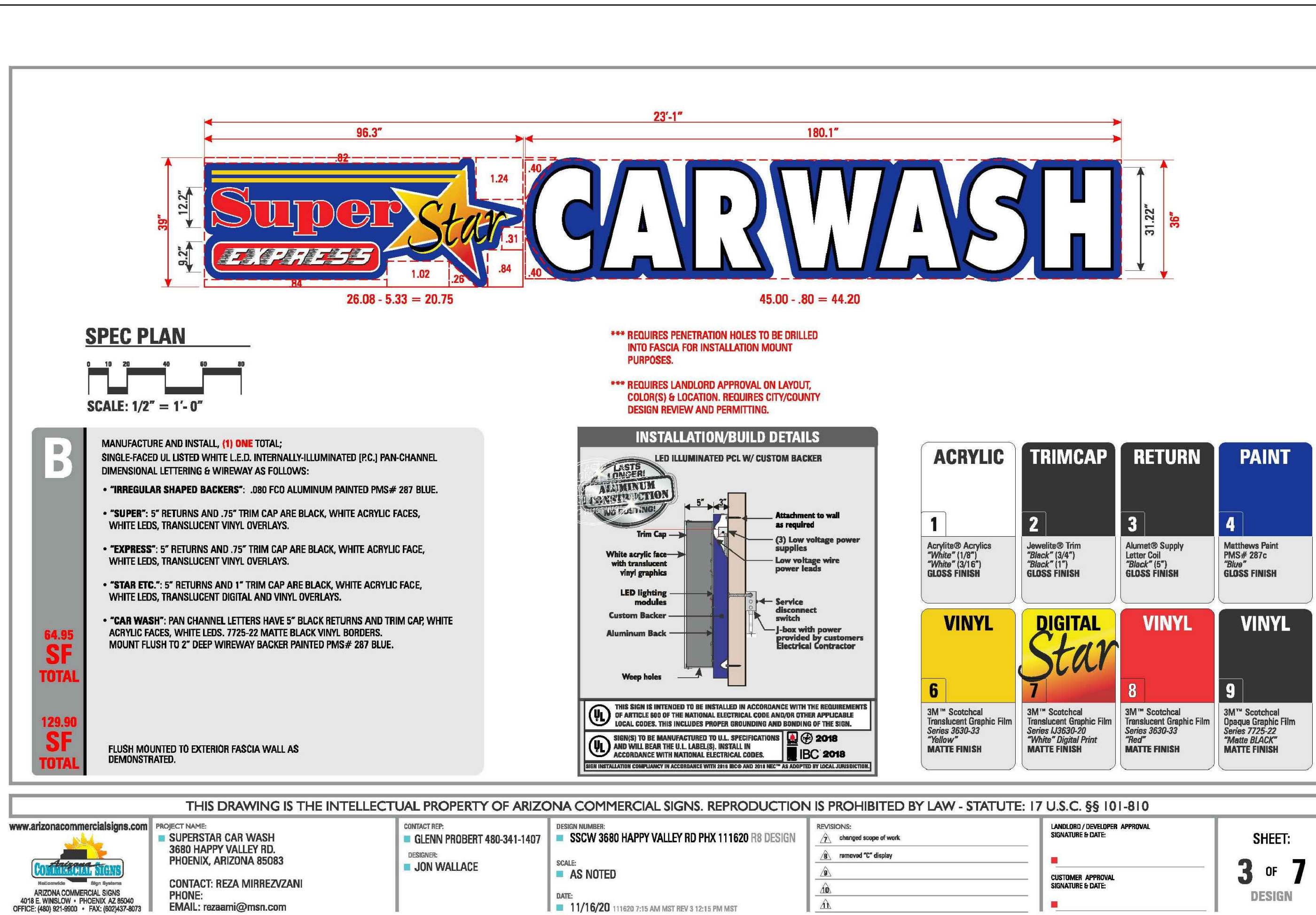
2 TYPICAL BUILDING SIGNAGE DETAIL SCALE: N.T.S.