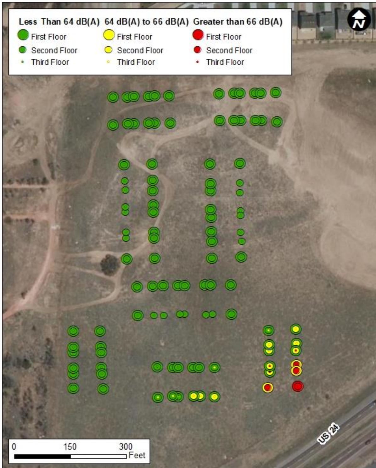
Figure 5 Existing Noise Levels