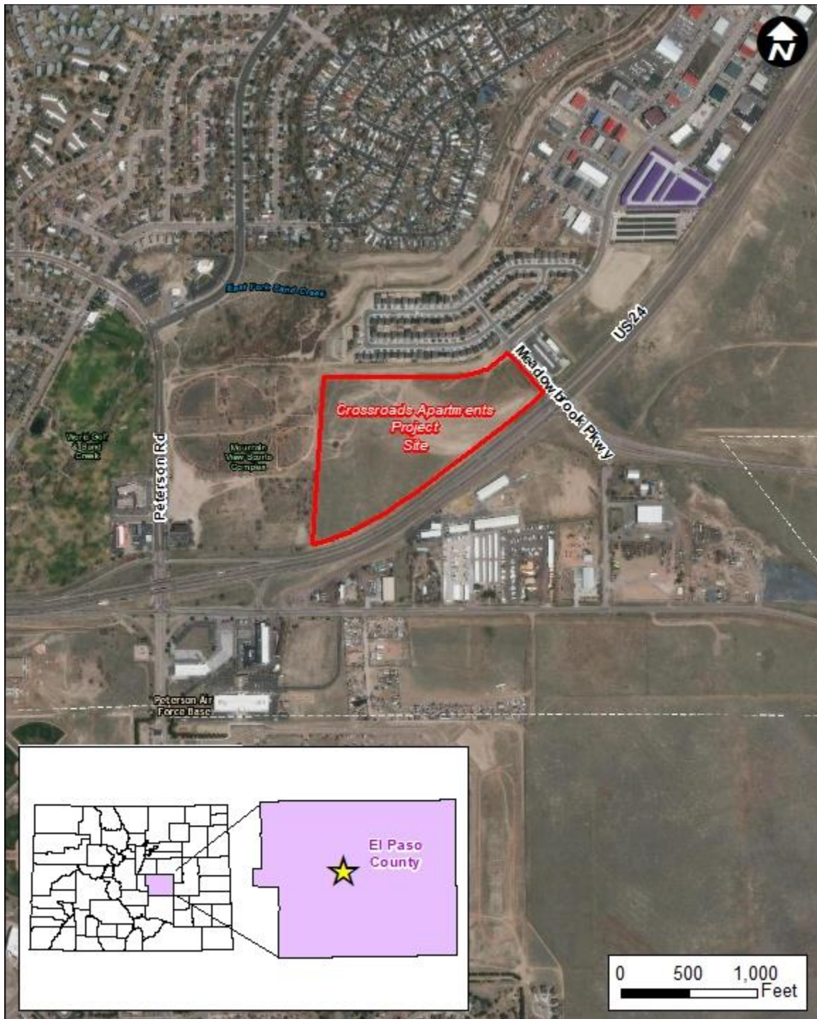
Figure 1: Site Location and Vicinity