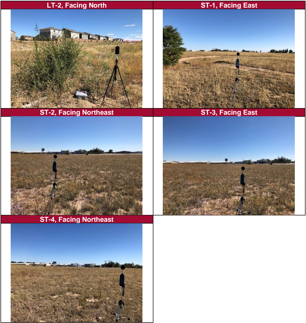
Table 2. Noise Measurement Setup Pictures