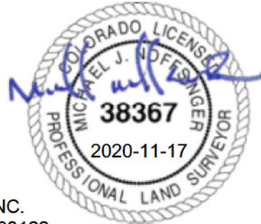
EXHIBIT ATTACHED AND MADE A PART HEREOF.