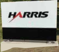
- Moved monument sign mounted on concrete foundation

A Residential and Business Community Colorado Springs Foreign Trade Zone