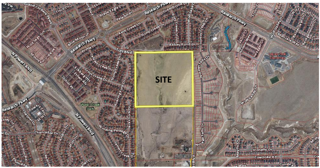
The 42.43-Acre site is in El Paso County, southeast of N Powers Blvd and Research Pkwy. The site is within in an area largely comprised of detached single-family housing and a large rural lot. Single-family residential development lies within the City to the north, east, and west and a large rural, agricultural lot directly south within the El Paso County enclave. The annexation is compliant with the 1/6 contiguity required for annexation, as the contiguous perimeter of the site is 74.32%.