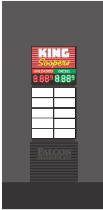
NIGHT VIEW SCALE: NTS