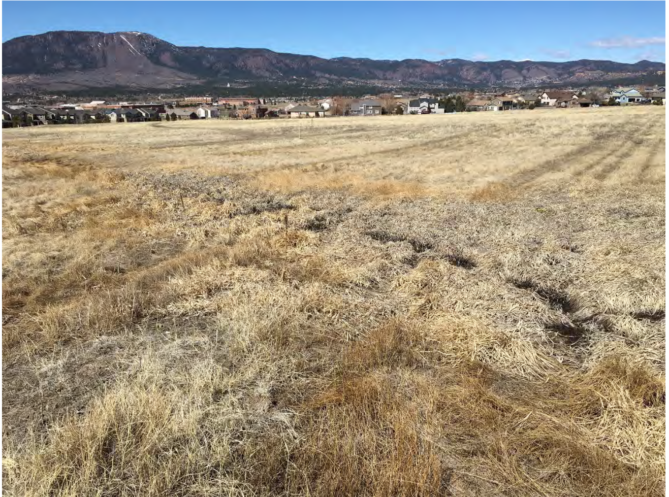
Photo 1. Isolated PEMC wetland facing northwest showing surface water and well-established rushes and sedges.