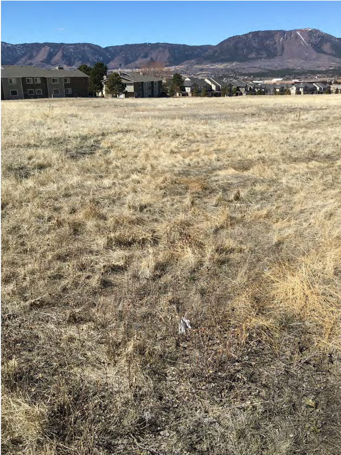
Photo 3. Facing west from the furthest extent of wetlands (the last rushes can just be seen on the right side) looking toward the adjacent multi-family housing. There are no downstream hydrologic connections, and no defined stream channels.