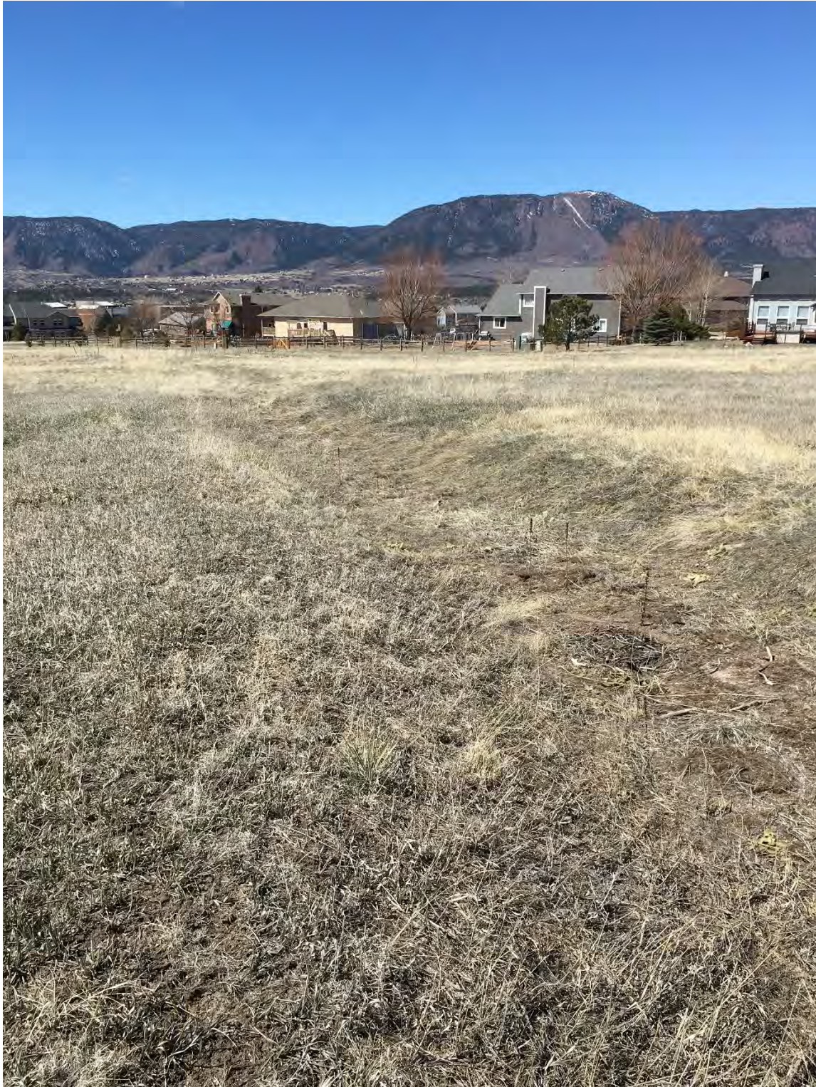
Photo 4. The erosional feature or upland swale where Teachout Creek was located historically, facing west. There is no defined channel and the feature ends abruptly before the fenced yard.