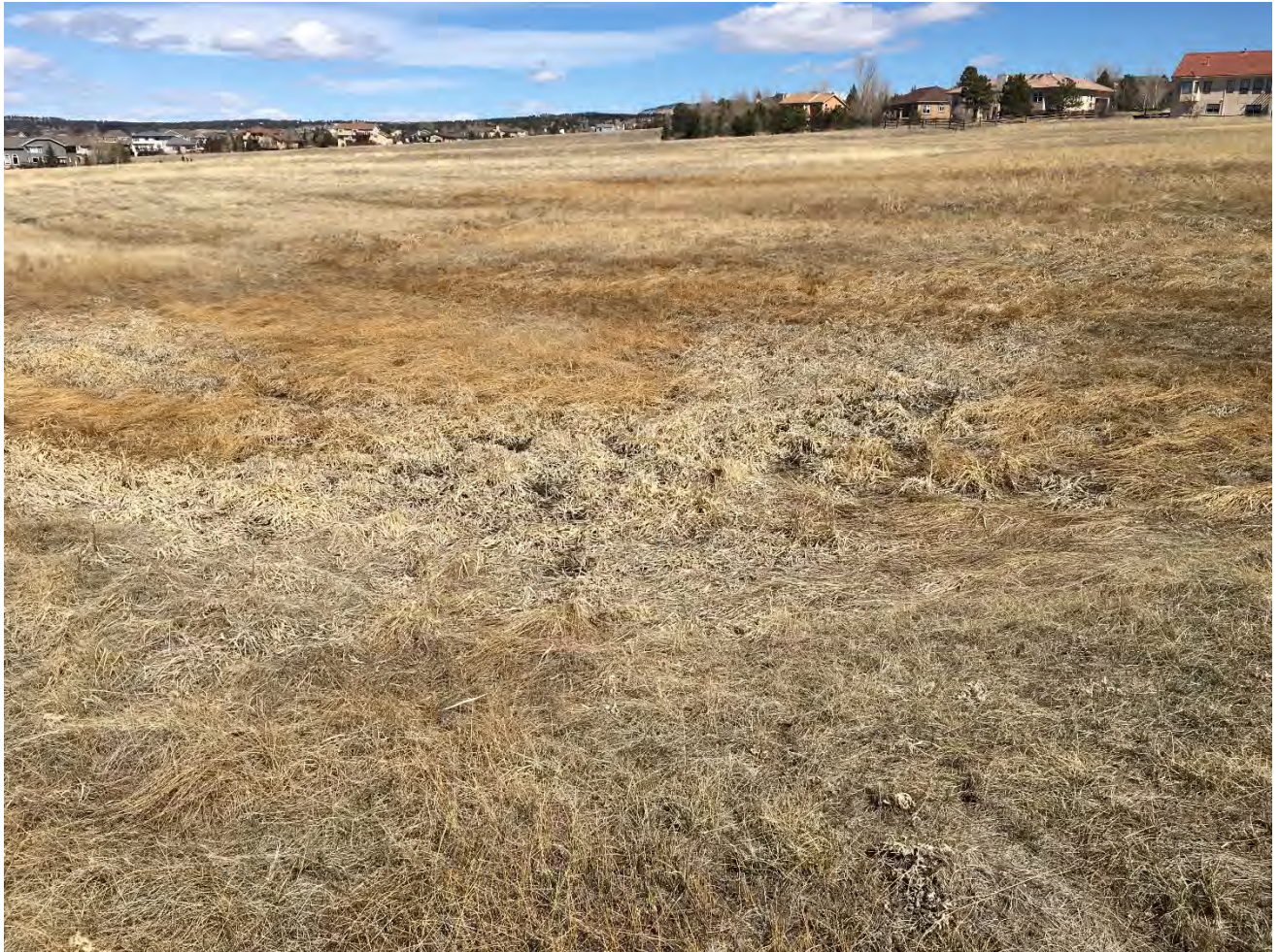
Photo 2. More wetland vegetation in a depression, facing north. Seeps are likely present that contribute most of the hydrology to this wetland.