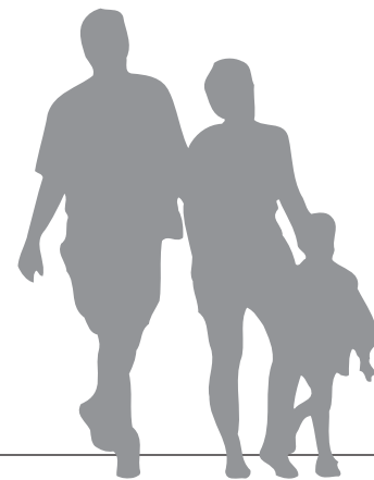
IMPOSE FOR LOCATION PURPOSE ONLY NOT TO SCALE