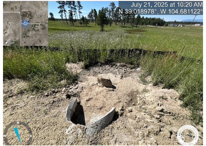
Photo 6: STA 1+70 Remove sediment accumulation from grouted riprap at west culvert.