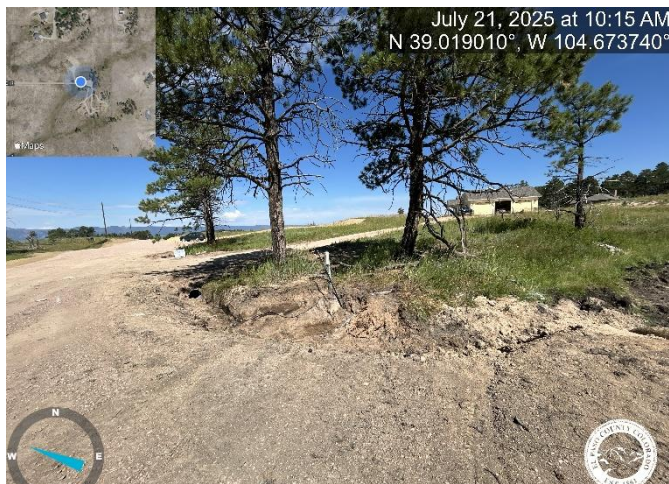
Photo 4: Backfill roadside ditch and stabilize near 8250 Forest Heights Cir