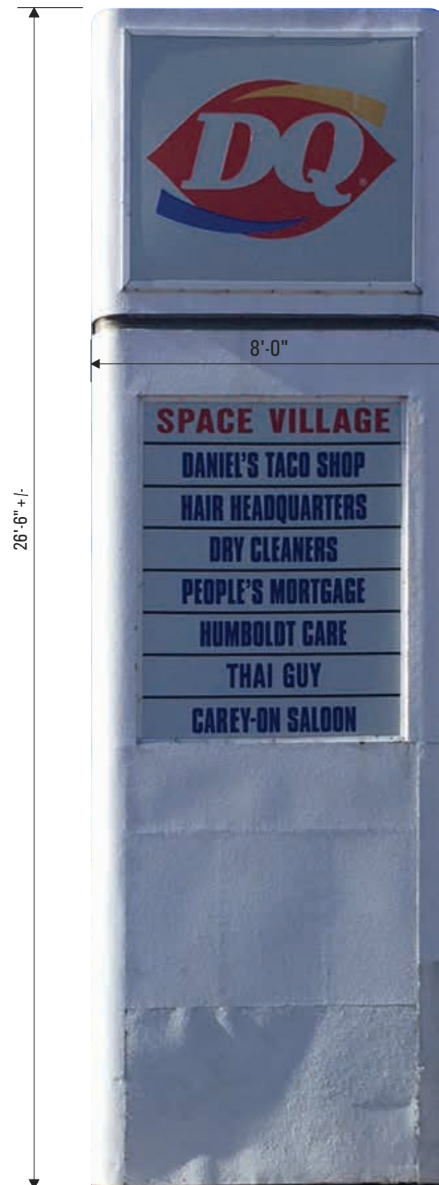
1.3 EXISTING PYLON