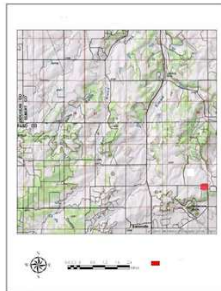
Figure 1 Map showing the location of the proposed subdivision in El Paso County, Colorado.